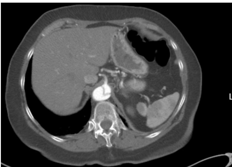
Post contrast CT Aorta showing descending thoracic aortic dissection