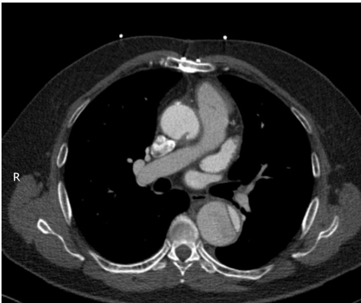
Pre contrast CT Aorta showing ascending and descending thoracic aortic dissection